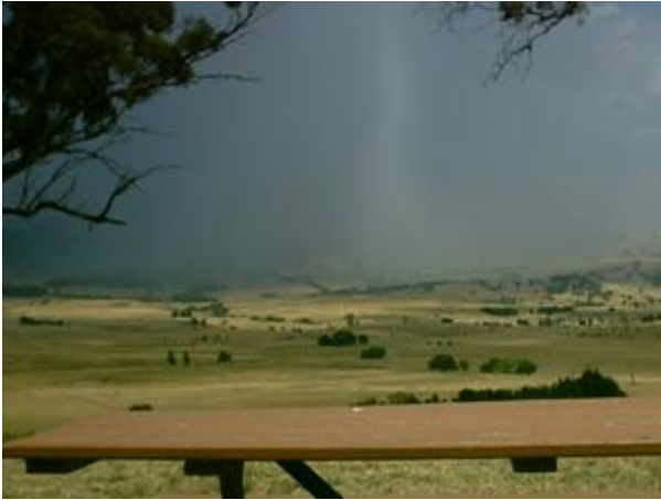
Some days you just watch the sky go by!