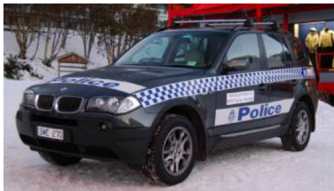
(When traveling to the mountain, style is everything)

A big thank you must go to the V.P.S.C for its generous sponsorship of the competitors and to Allan Briggs of the Public Relations Office for arranging sponsorship from BMW Australia in the form of a BMW x 3 four wheel drive .