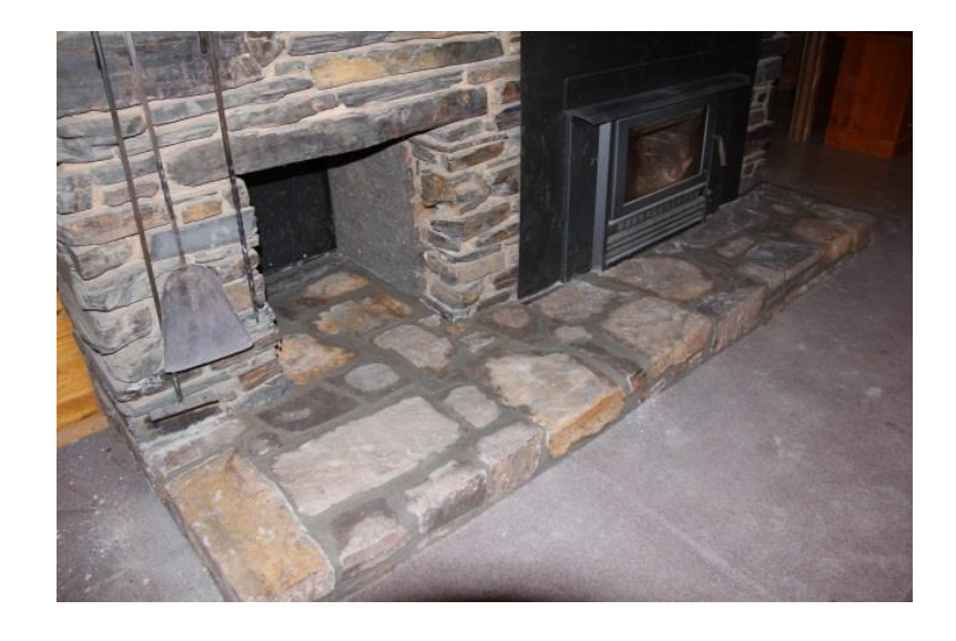
Carpet – the lounge area has been re-carpeted with durable carpet tiles, which enable the worn areas to be replaced easily – looks great