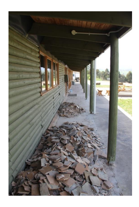
Final Result of all the work.